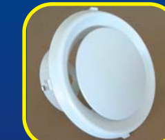
Multi Directional Outlet – Adjustable Blade Multi Directional Outlet – Fixed Blade Silent Air T/Bar Diffuser Variable Round Outlet Circular Heritage Outlet Polytech Round Outlet